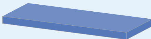
Shrinkable Polystyrene Monolayer Film

APS-S - A moderate shrinkage OPS film for shrink sleeve and tamper evident applications.